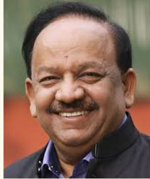
Dr. Harsh Vardhan Ji Hon'ble Union Health Minister Ministry of Health and Family Welfare, Government of India